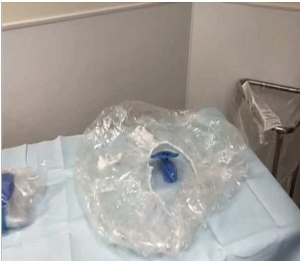
Step 1 Open light drape using sterile technique. Ensure Drape is inside out-tabs are inside drape