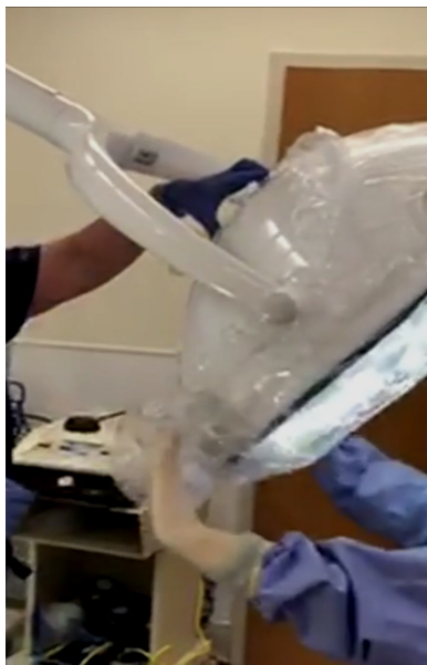
Step 4 Hands of positioner remain inside of light drape. Flip drape over bottom of light lens.