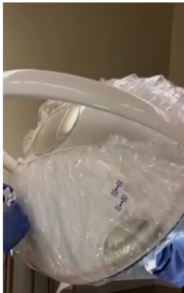
Step 5 Pull any excess drape behind lens and secure with sticky straps across back of light