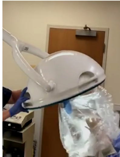
Step 2 Attach the blue universal handle over surgical light handle.