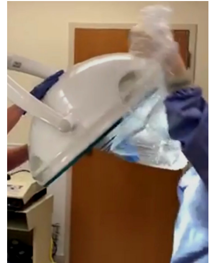
Step 3 Hands of positioner remain inside of light drape. Flip drape over top of light lens.